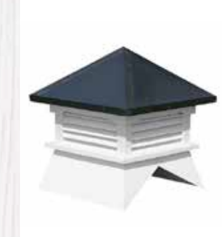
Shed Cupola, White