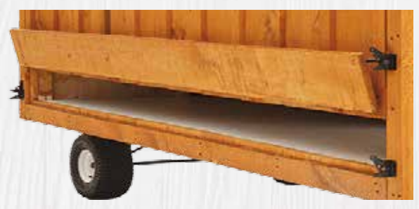
Clean-Out Lid For Litter Tray Shown Above

Litter Tray covering under roost bars only (requires clean out lid) Available for the following: A124 0716C 072