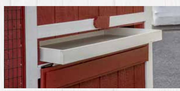
Clean-Out Lid For Litter Tray Shown Below