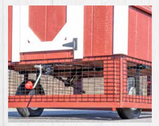
The Wheel Lift Lever is standard on all tractor models. also available on models: A57C, A46C

Wheel Lift Lever Kit Available for all runs.