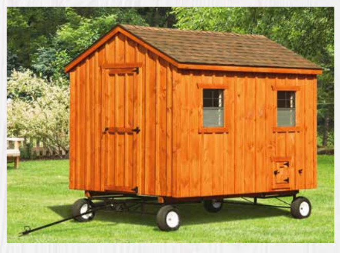
Four Wheels with Steering Handle, Heavy Duty Available on models: Q72,Q712, A80, A60