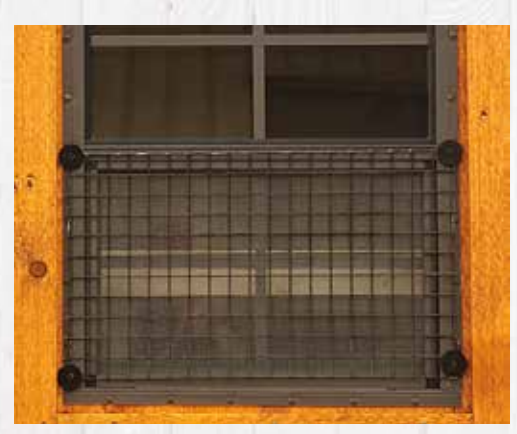
Wire over window