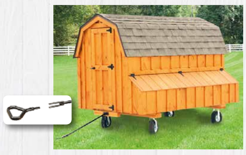
Four Wheels with Handle Available on Models: Q44, L35, D44, A44, L45