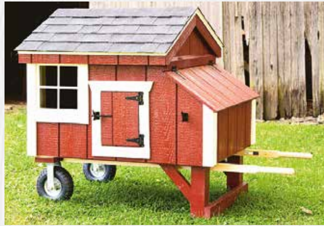
Wheelbarrow System Available on models: A33, L34, L35