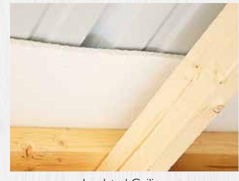
Insulated Ceiling Standard on metal roof option