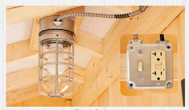
Electric Package Switch / Outlet / Lights Extension Cord Hookup