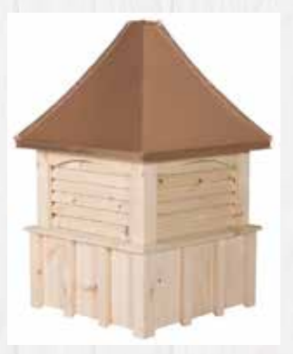
Board & Batten Wood w/ Copper Top